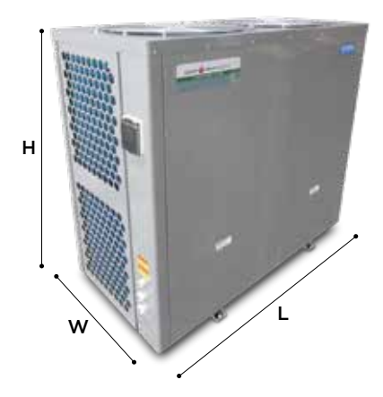
* No obstruction within 4 metres to allow cold air dispersal Clearance to rear min 60cm Clearance for service access 60cm