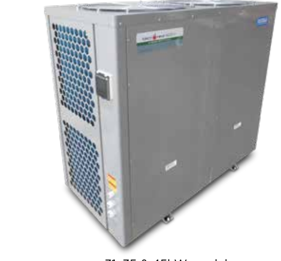
31, 35 & 45kW models heat and cool